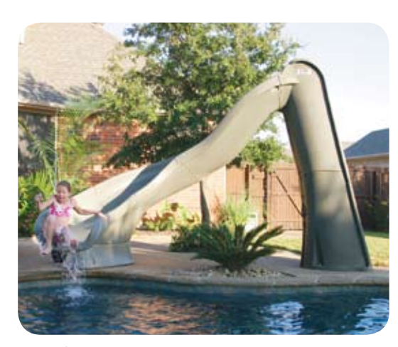
Over 8ft tall — Bigger slide. Bigger thrills!