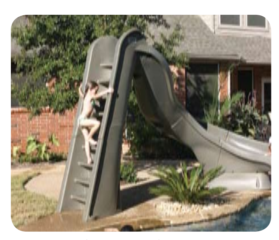
Enclosed ladder for maximum safety.