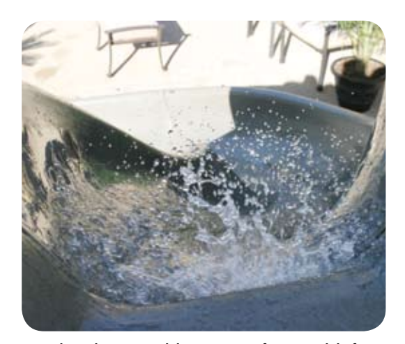
GrandRapids™ water delivery system for more slide fun!